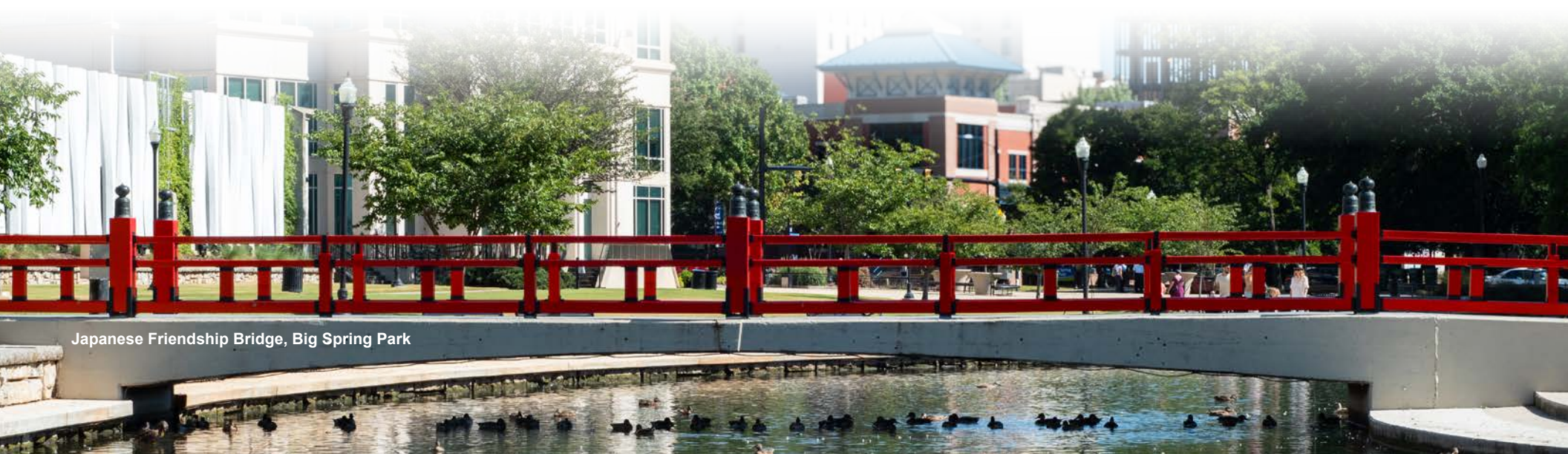
Japanese Friendship Bridge, Big Spring Park

Today, Downtown Huntsville is thriving, and the vibrancy of the city can be felt and seen both during the day, and at night! There are plenty of things to do and places to eat downtown, so plan to make a day of it if you have the time, and enjoy the heart of Huntsville to the fullest.